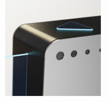
SCANNING. An integrated receiptscanner is available as option.

INTELLIGENT AND CONNECTED SigmaGate is ready to be connect-